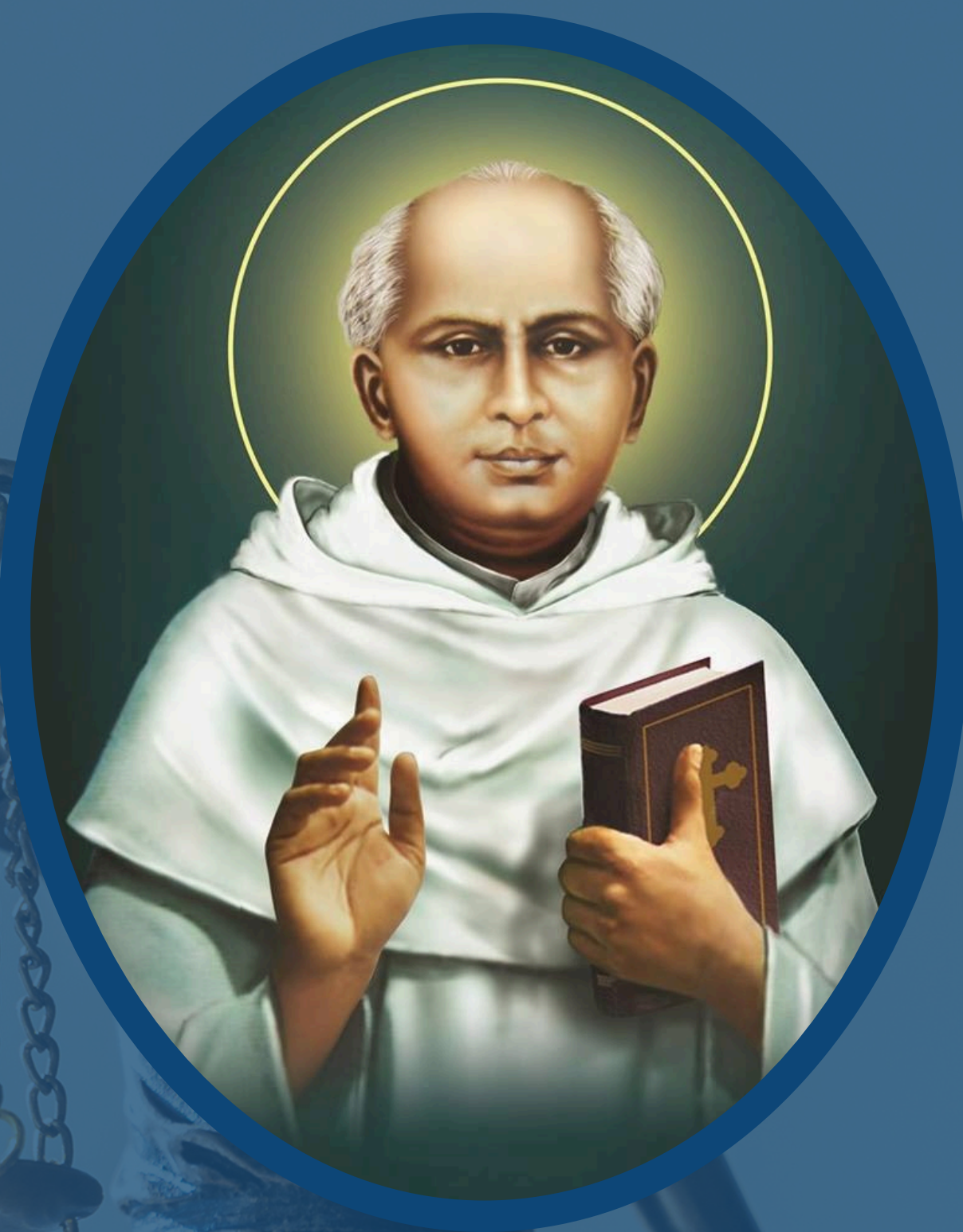
St. Kuriakose Elias Chavara Founder, CMI Congregation

Kristu Jayanti College has three academic entities namely Kristu Jayanti College(Autonomous), Kristu Jayanti School of Management and Kristu Jayanti College of Law. Kristu Jayanti College (Autonomous) was re-accredited by NAAC with a grade of "A++" in 2021 and it is an autonomous college under the Bengaluru North University. Kristu Jayanti School of Management is one of the most sought-after business schools in the country. Kristu Jayanti College of Law was established in the year 2017 and is affiliated with Karnataka State Law University, Hubballi and approved by the Bar Council of India. In its seven years of existence, it has provided its students with the best academic resources and infrastructural facilities. The Knowledge Center of the college is updated with the latest editions of law books and journals, which help the students in enhancing their knowledge in the field of law. The college organizes several extracurricular activities such as Intra-Collegiate Moot Court Competition, Intra-Collegiate MUN Competition, Kaladarpan - Cultural Fest, Carpe Diem - Legal Fest and Inter-College Sports events that aid the students to nurture their holistic development.